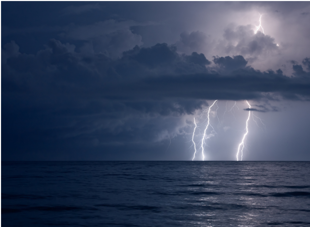
Wind and Waves